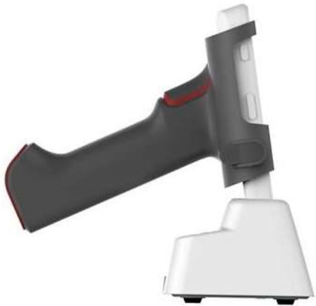
PDA Only Base