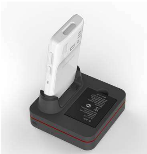
Home base With Battery